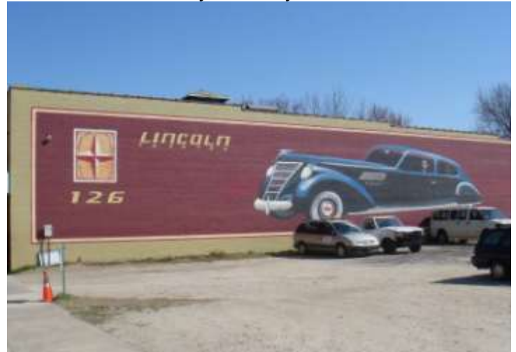
Lincoln 'Theatre' - '36 Lincoln with the President driving!

While visiting Raleigh, NC recently my interest was piqued by a billboard wall slightly visible about 2 blocks away from my hotel room.