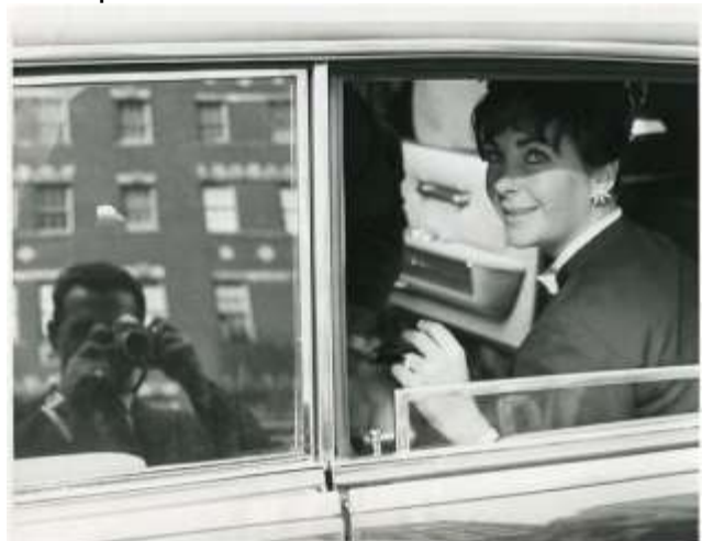
And here a Lincoln Limousine tribute to Elizabeth Taylor.....

I've read that in 1962 her husband borrowed a lot of money from her—and bought her a '62 Lincoln convertible as a 'gift' using her own money. She was upset! But—who wouldn't want a 62?