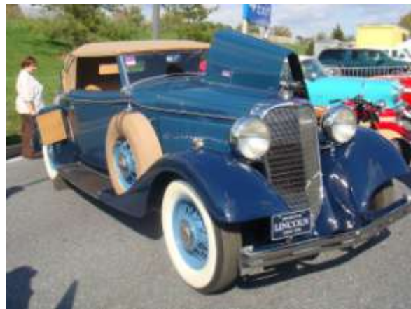
A beautiful 1933 KA Lincoln V-12 at Hershey

Please let us know an activity that would entice you—for it would probably appeal to others as well—and we'll work to make it happen!