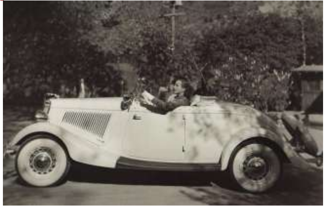
Ms. Crawford in her 1938 Model K

Ms. Crawford had her own Lincoln Convertible long before the '47—a beautiful Model K, at a time when Ms. Crawford was said to be as sleek and beautiful as the car!