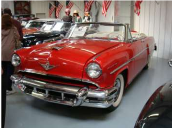
A stunning 54 Lincoln convertible catches everyone's eye