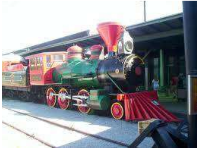
With train tracks leading to the rear of the hotel, it offers fun train rides and even sleeper car rooms!

He and the Board will be calling on our members to take on assignments to spread out the work to be accomplished, and hope many can volunteer a few hours to assist.