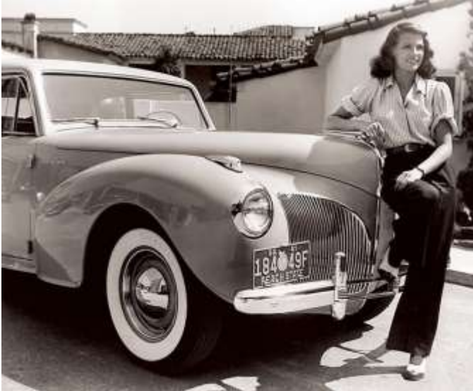
The '41, with GA plates, although the setting looks more like CA!

Actress Rita Hayworth's ownership of a '41 Lincoln Continental was well known, but there are rumors as to how she came to own it. Supposedly Orson Welles had the Paradise Green car delivered to her while working on a film in Georgia- hence the GA plates in this photo?