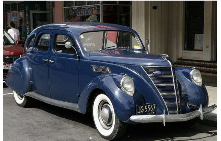
It's like the billboard artists saw this very same photograph—except President Lincoln isn't driving this one!