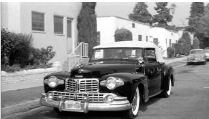
The '47 driven in the movie 'What Ever happened to Betty Jane'

It is reported Ms. Hayworth owned and drove this Lincoln nearly 30 years, and it was sold at auction. Of course, Ms. Hayworth may have just been following in the footsteps of the infamous Joan Crawford—also a Lincoln fan long before having her 'Baby Jane' sister supposedly try to kill her with a '47 Lincoln on film!