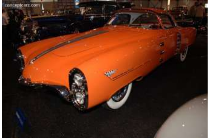
Lincoln Indianapolis , that was thought to have been given to Errol Flynn by Henry Ford II after the show tour....

In 1955, the Lincoln Indianapolis concept was developed to showcase ideas soon to be seen on modern Lincolns. From the website 'conceptcarz.com' comes images of this little known beauty.