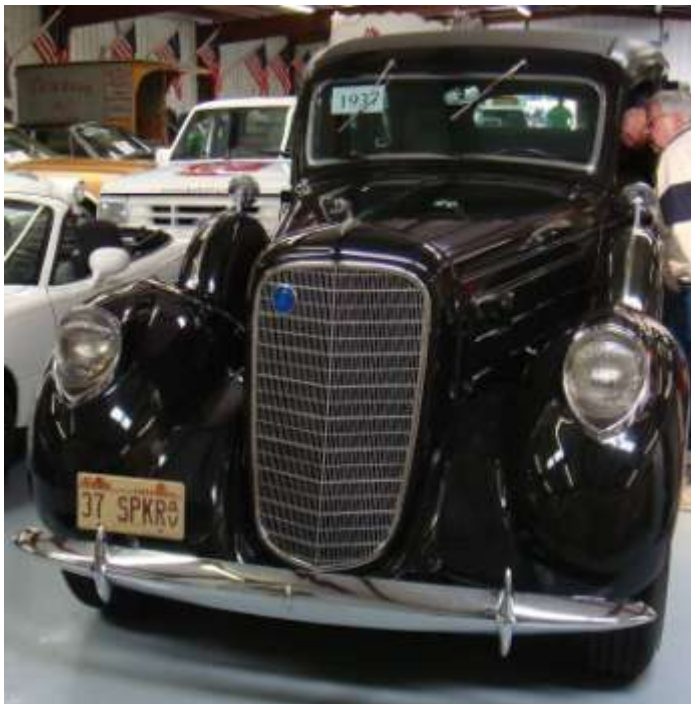
A 1937 V-12, lovely to behold, and one can see it up close!

There are a number of hotels near the I-285/ I-75 intersection for a Friday night stay.