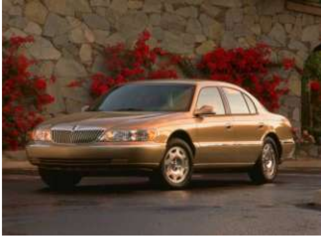
1998 Continental owned by Microsoft's Steve Ballmer

Last issue began a series on Lincolns owned by celebrities, with Jackie Gleason's limousine. This issue we look at others connected with 'America's finest motorcar.' This time we peruse what the internet brings forth: