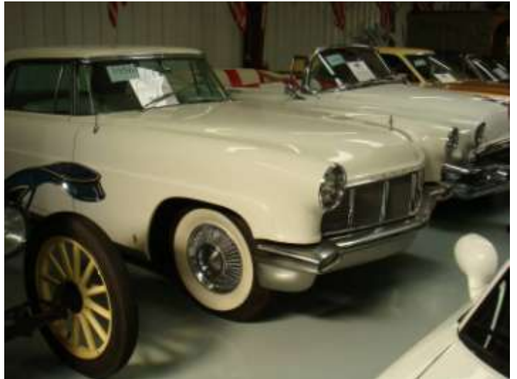
This 56 Mark II outshines its neighbors.....

While the collection is eclectic, that is a large part of the fun—from Avanti to Zephyr, Land Rover to Pontiac – there is a lot to see and discuss.